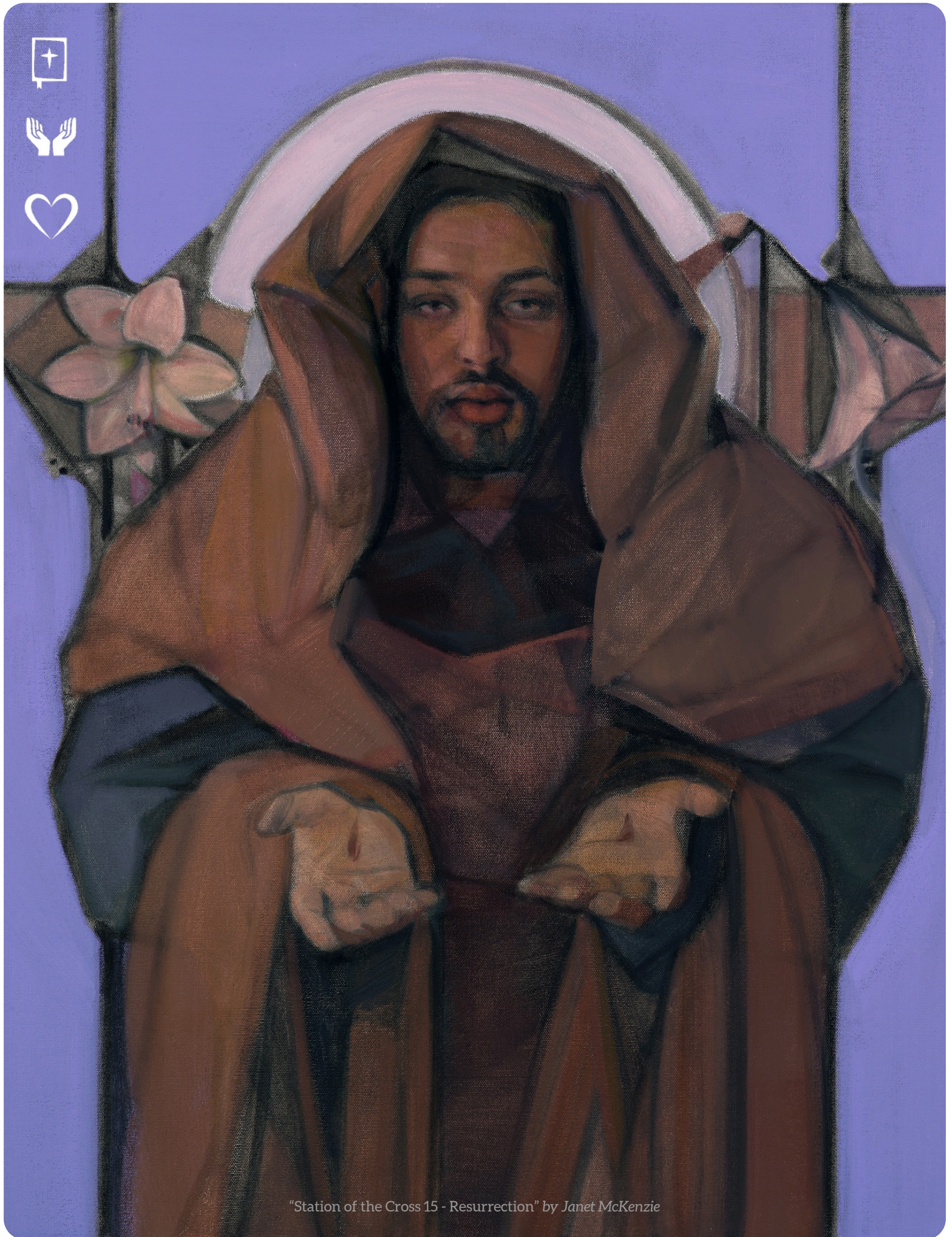
"Station of the Cross 15 - Resurrection" by Janet McKenzie