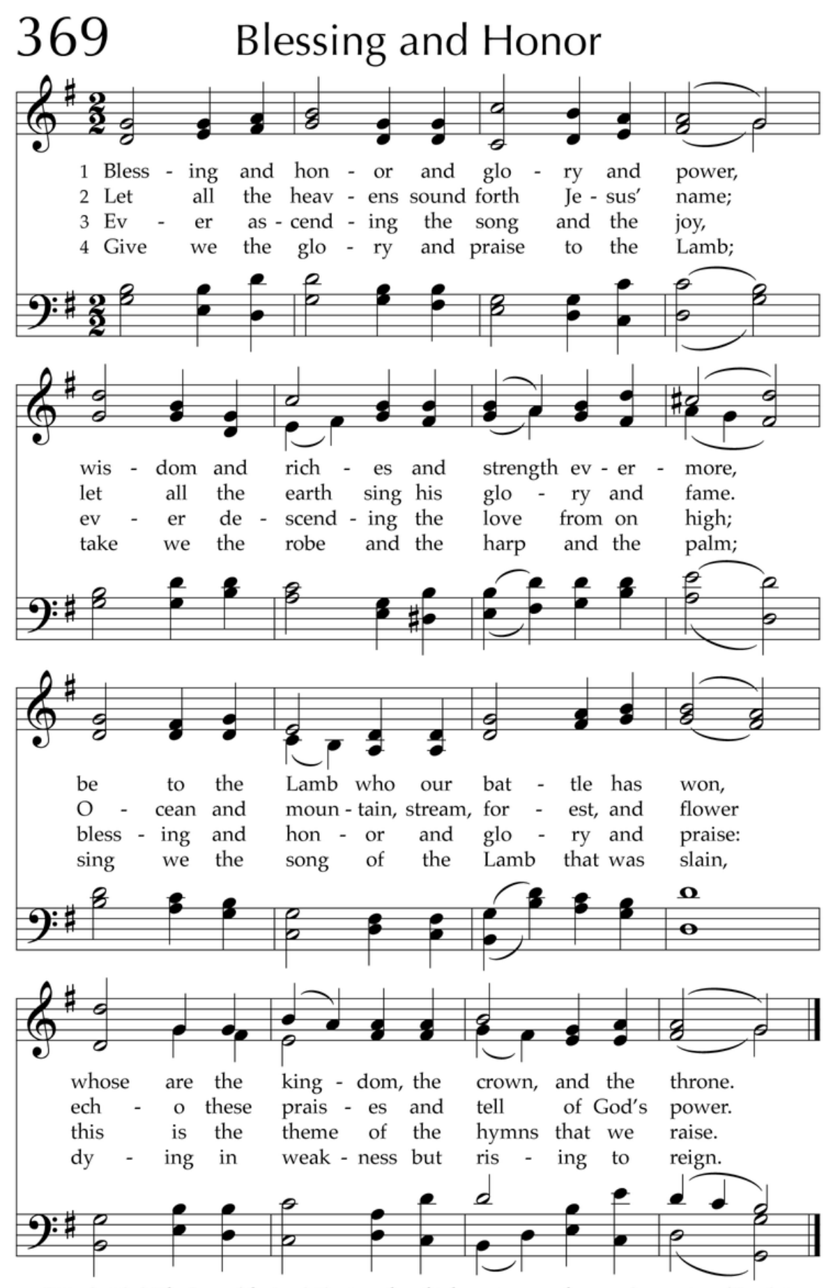
Fittingly titled "The Song of the Lamb" by its author, this hymn is a paraphrase and expansion of Revelation 5:12. It is set here to a resonant French tune of a kind that flourished in the transition from the older chant style to the harmonies and rhythms of modern hymns.