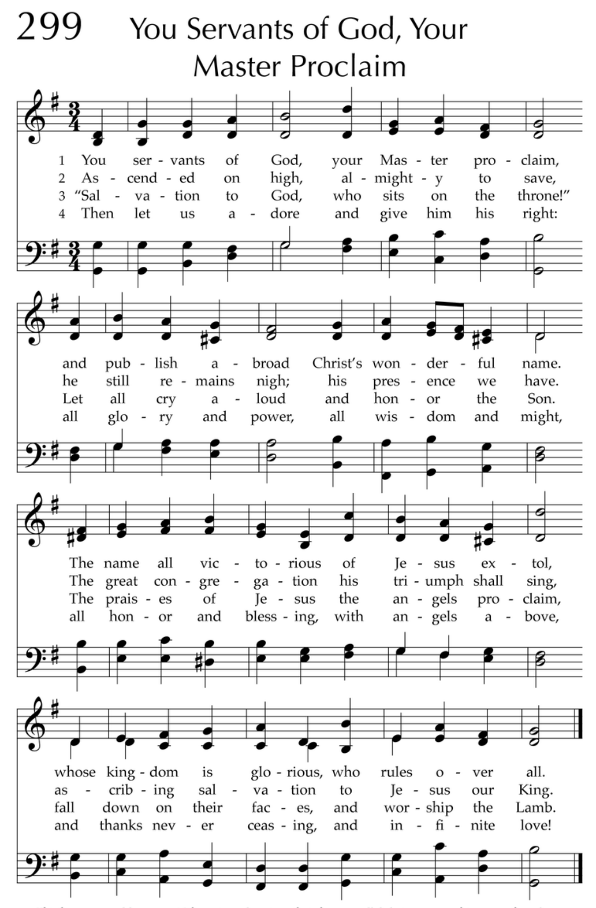
This hymn resembles many 18th-century drawings that show parallels between worship on earth and worship in heaven, especially as described in Revelation 7:9–11. This 18th-century tune has had many names; the one used here honors the dynasty of British monarchs, 1714–1901.