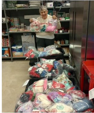
Haven Totes Excited to Give out all the great pajamas.