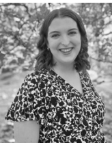
Taylor Conaway Memorial member