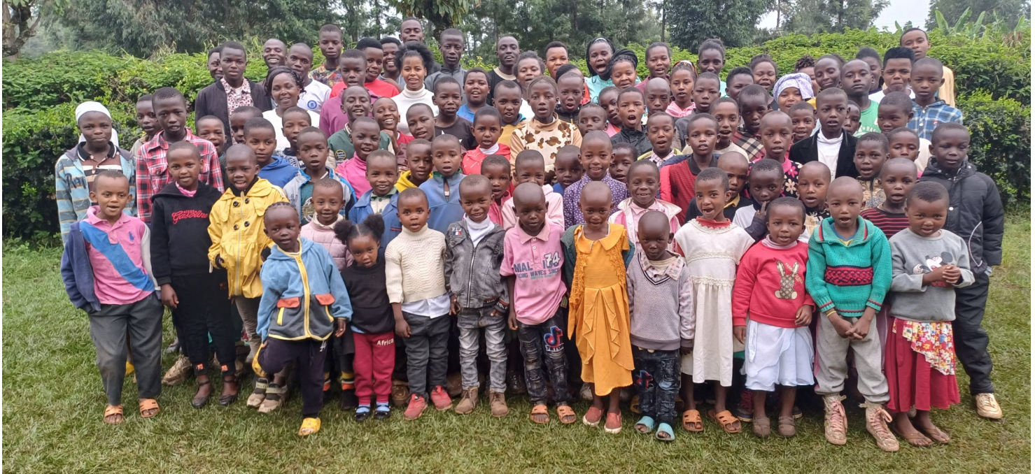
Blessing Kaene Empowerment Group (and their siblings), Kenya. 25 Households and a total of 99 children. Partnered with South West District of the Florida United Methodist Church.

Vol. 7 Trinity United Methodist Church, Sarasota, FL July 2024