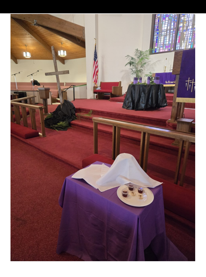
Maundy Thursday service