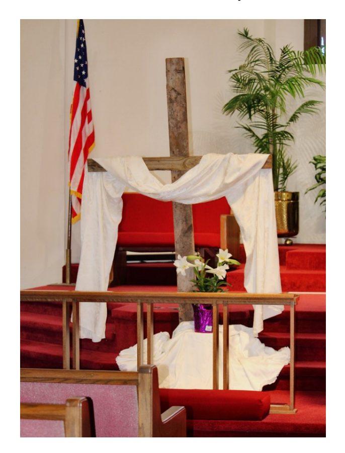
Easter Sunday Worship