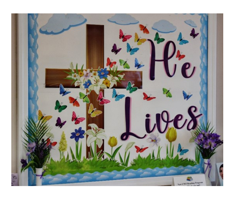
Haley Hall Easter Brunch