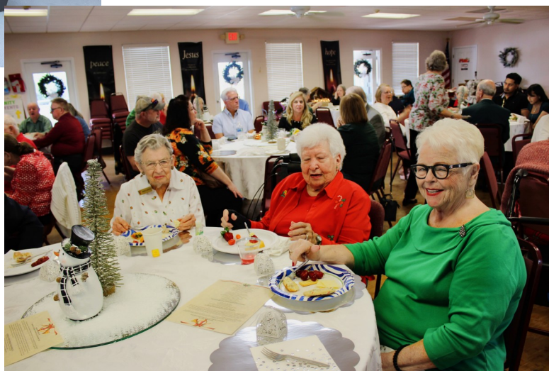
UWF hosted a Christmas Brunch on December 21