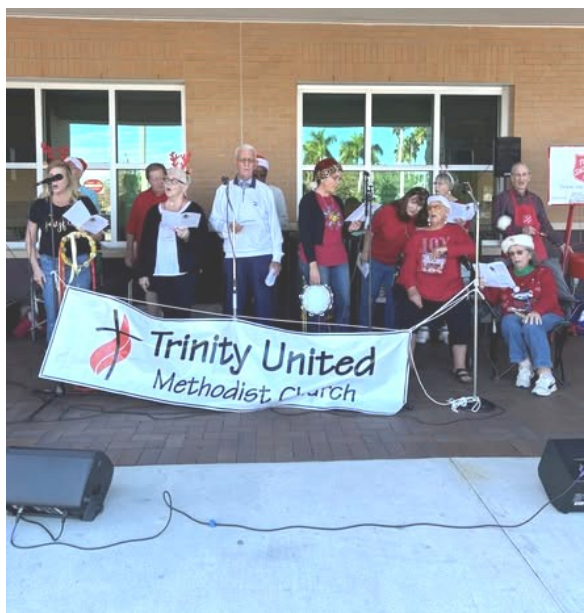
Caroling and ringing the bell at the Landings Publix