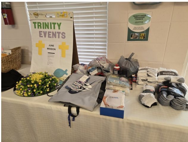
Items collected for June Mission Moment for the men of Remnant Cafe