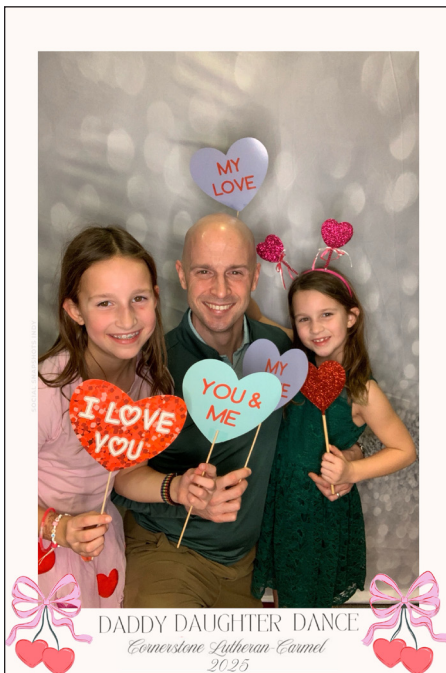
DADDY DAUGHTER DANCE Cornerstone Lutheran Carmel 2025

It was a magical night at the Daddy Daughter Dances last month at our Carmel and Fishers sites! The dance areas were decorated beautifully and the girls and their dates enjoyed music and dancing, snacks, and more. Each location had more than 350 attendees! We thank all the volunteers, including those Middle School youth who helped out, and our Carmel and Fishers MomCo groups for hosting these opportunities for our dads and daughters to spend special time together.