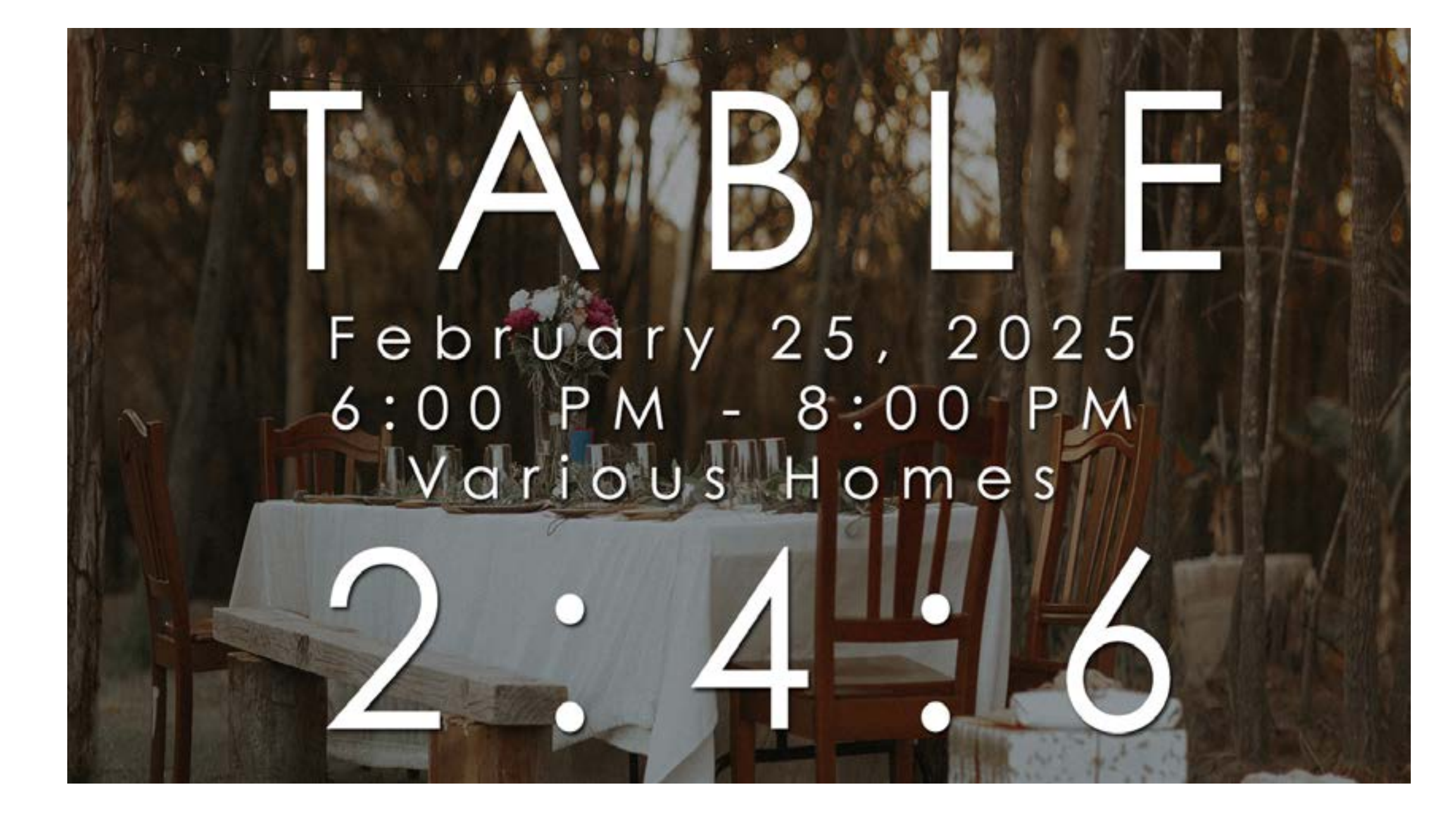
Table 246 will be held in host homes.

CHILDCARE WILL BE PROVIDED WITH REGISTRATION 48 HOURS PRIOR. A small meal will be provided for kiddos. Click <u>HERE</u> for more info and to reserve childcare.