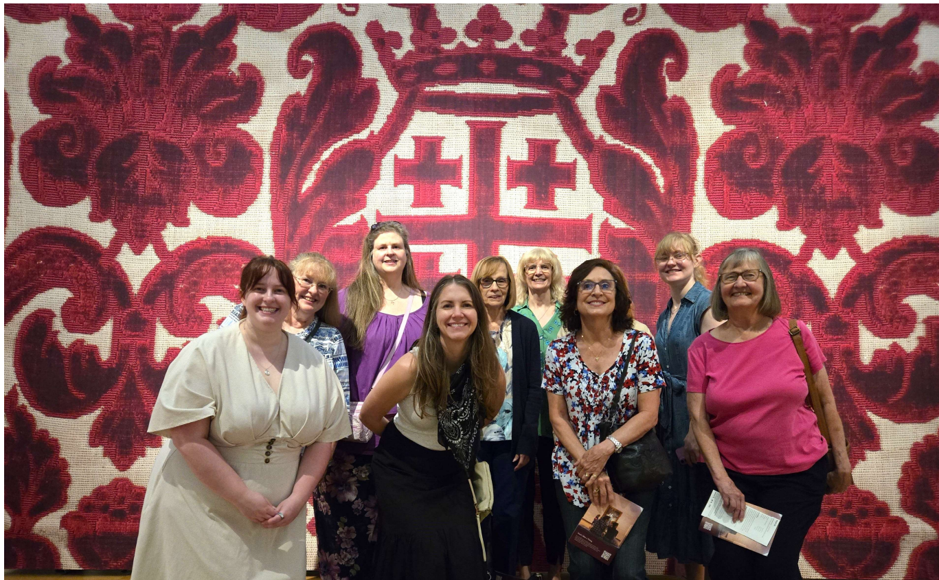
Pictured in front of a floor-to-ceiling tapestry of the Jerusalem Cross

Our field trip to the Kimbell Art Museum turned out to be a wonderful time. There were ten of us in total, and we all piled into a van to make the trip together. From the moment we hit the road, it felt less like a formal outing and more like an adventure with friends. We laughed, caught up on each other's lives, and enjoyed the simple pleasure of being together.