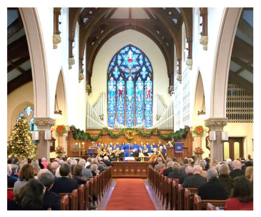
December 10, 2023, in 10:00 a.m. Worship Festive Reception to Follow Cantata Sunday is made possible through generous gifts to the Music Fund.

presented by the Chancel Choir, Soloists, & Orchestra