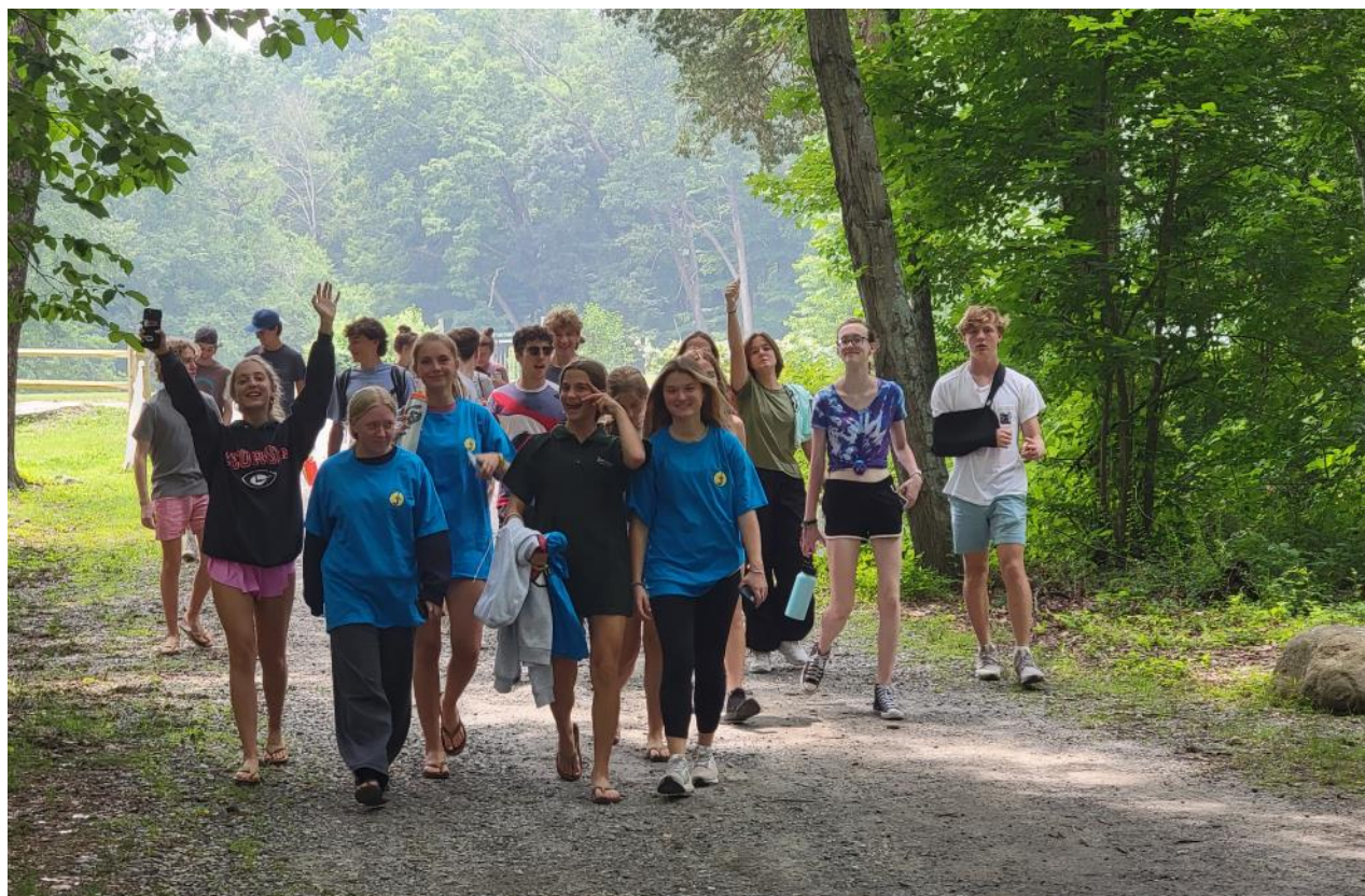
Youth Mission Trip 2023