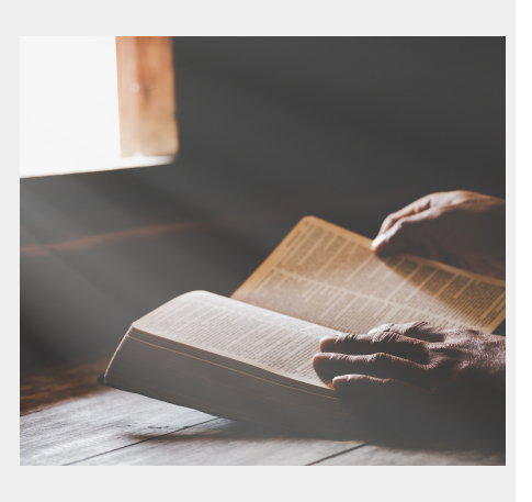
Hey Family, Let's Talk About This!

Bulletin Inserts for the Liturgical Life of the Parish: The Mass © 2020 Archdiocese of Chicago: Liturgy Training Publications. All rights reserved. Written by Paul Turner.