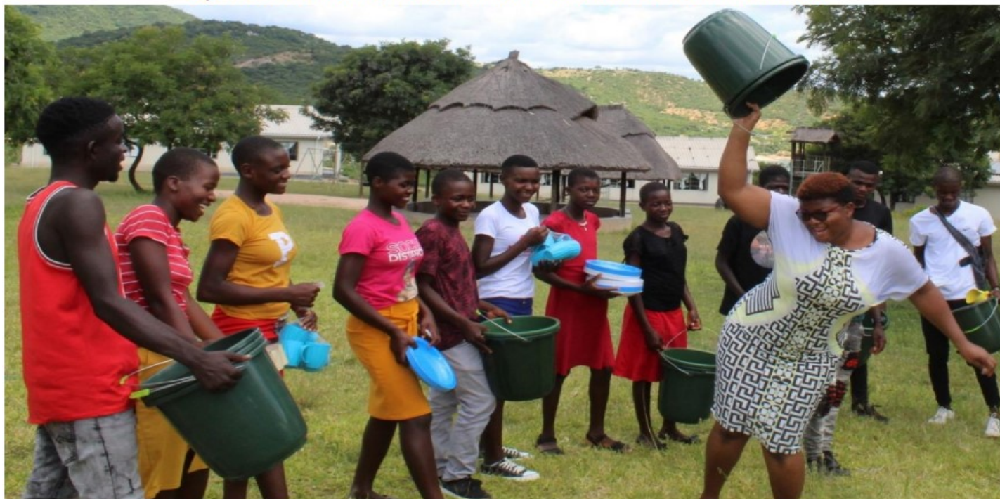
A "mother" from the Kudavana Children's Home in Mutare expresses her joy at receiving donations from Zoe Empowers groups.