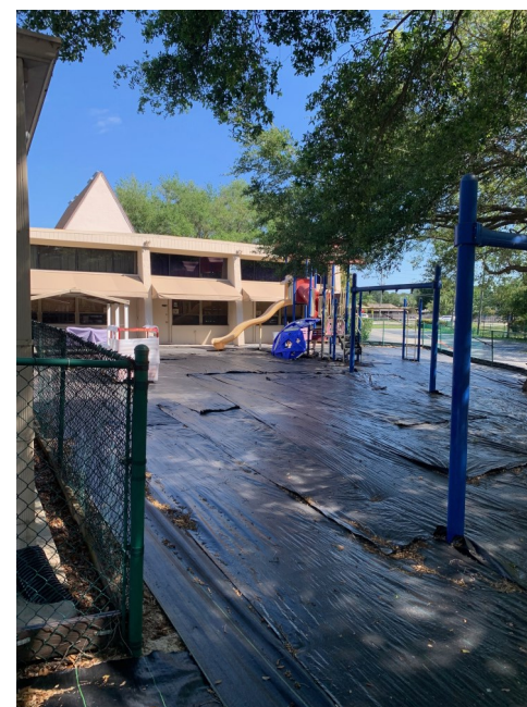
VPK & 3 Year Old Playground Under Construction

The work is scheduled to begin the week of April 1st and should be completed by May 3rd. During this time, the children will enjoy their gross motor playtime in our full-sized gymnasium.