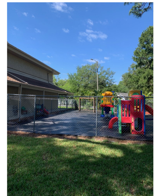
2 Year Old Playground Under Construction