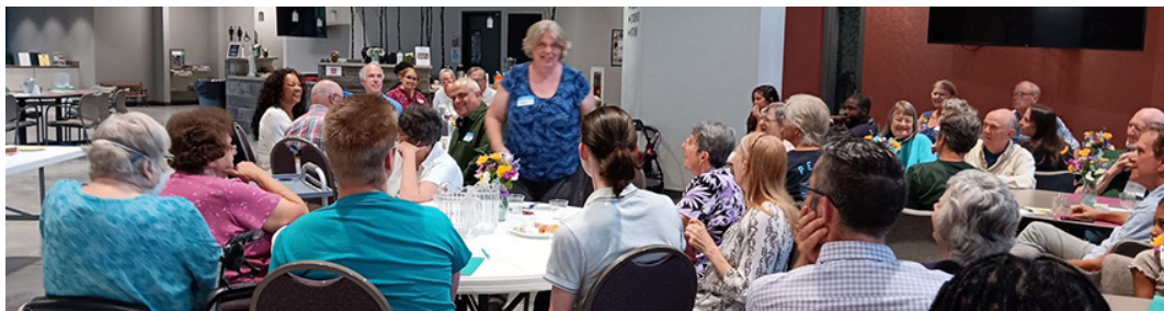
(Moving Circles... con't from page 7)

get to know each other, break bread together, and build relationships. These conversations allow us to widen our circles, to have more diverse friends, and to build what the Rev. Dr. Martin Luther King called the "Beloved Community." By getting to know one another we break down the human-made barriers that keep us apart, and create more welcoming and sustainable communities.