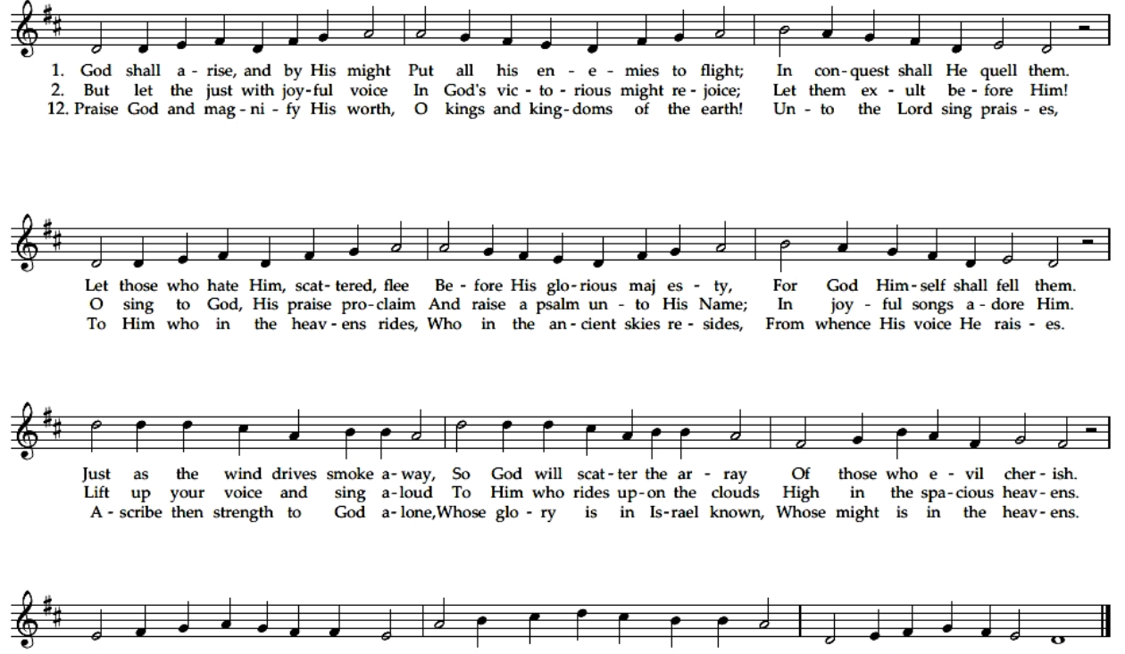
As wax that melts be-fore the fire, So, van-quished by God's dread - ful ire, Shall all the wick - ed per - ish. The Lord, that is His glo-rious Name. Sing un - to Him with loud ac-claim; To Him be glo - ry giv - en. He from His tem-ple ter - ror sows, But on His peop-ple strength be-stows. To God let praise be giv - en.