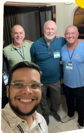
My Connection Group