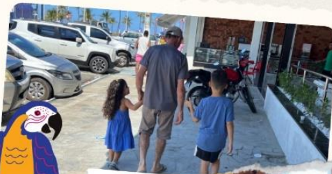
Lunch with Grandpa