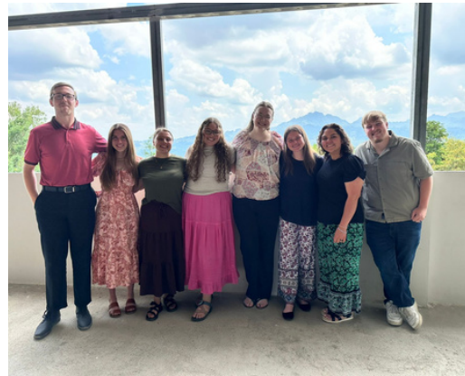
OUR CUTE WHOLE TEAM <3