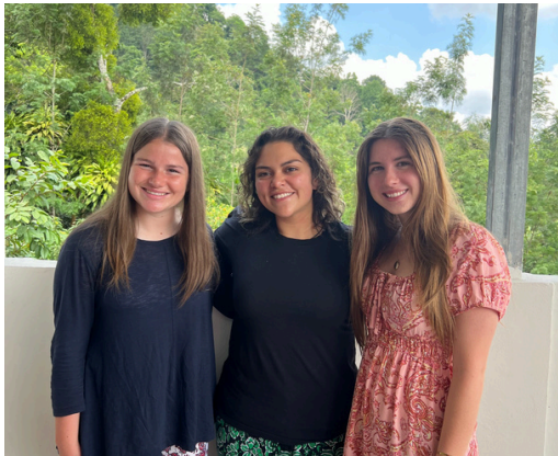
NEW AIM TEAM!

this month wasn't too too crazy, until it was! so lets start with the beginning of the month, as always we did our normalities such as, young adult group, ladies group, and youth group. along with radical! this month in radical the values i taught about were transparency, love, and sincerity! all very good things to teach young kids! i love being able to get closer with my kids and grow in my relationship with them and of course teach them about Jesus and the bible! i ask that you guys be in prayer for me as we are about almost halfway through the school year, to have strength to keep pushing and energy to help the kids understand the importance of life values!