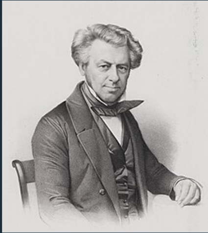
Johann Gerhard Oncken

“Every member a missionary, every church a mission society.”