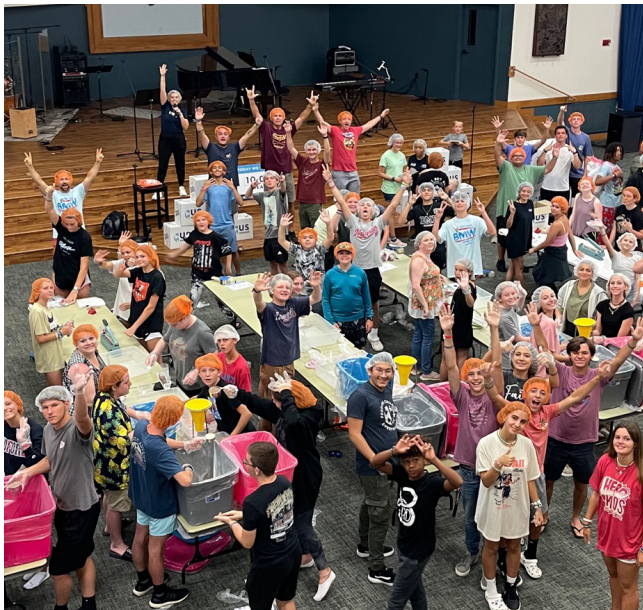
Students attending Brevard Mission Week 2024 packaged 10,000 meals for people experiencing food insecurity across the world!

Place this bookmark in your Bible or devotion as a reminder to pray daily for God's guidance throughout this campaign!