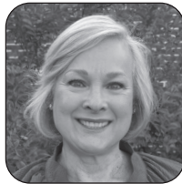
Connie Hill Parkway/Graham Parish