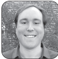
Thomas Hayden Parkway/Graham Parish