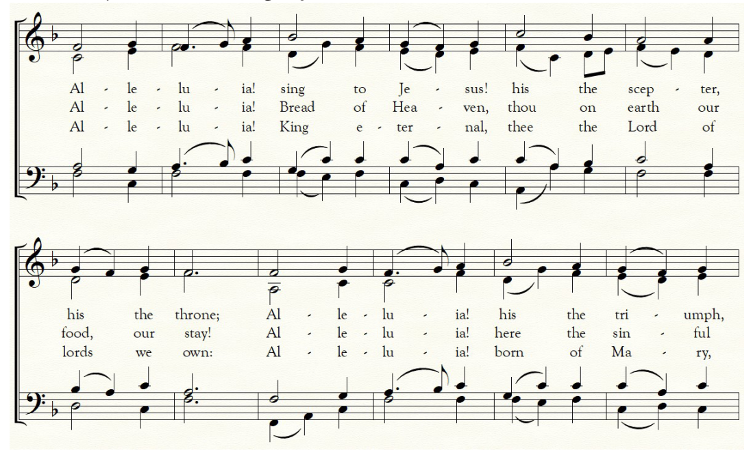
Recessional Hymn, Alleluia! Sing to Jesus