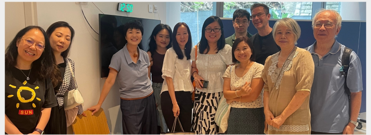
Bless the City in May