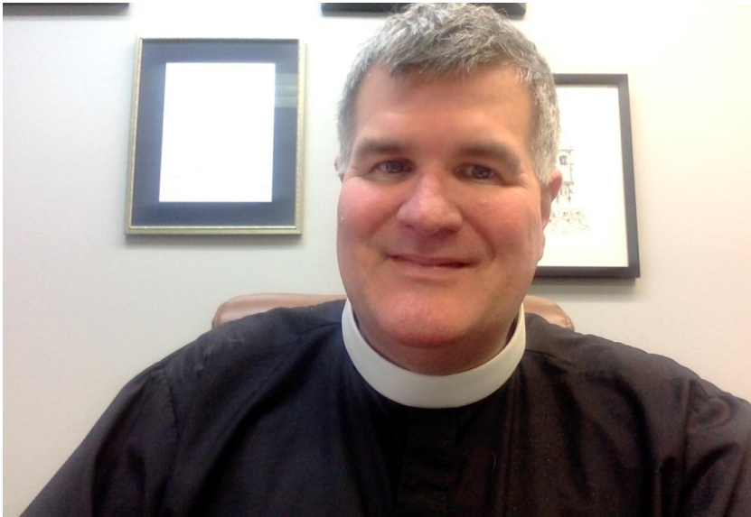
Rector of Grace, Monroe