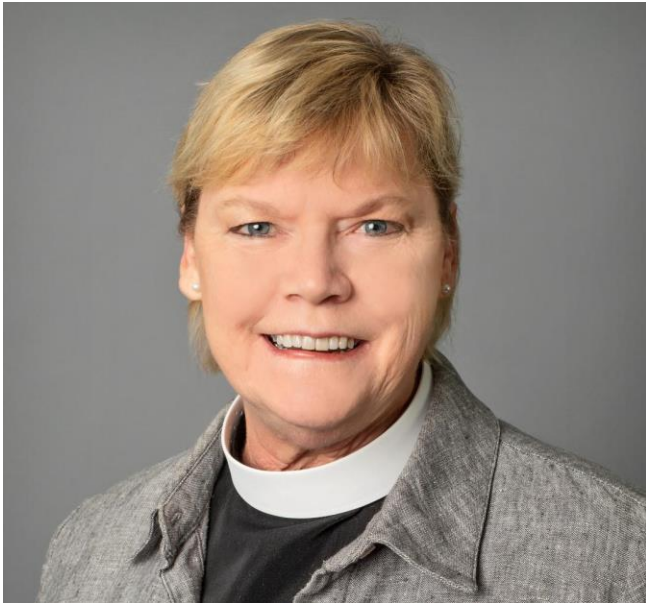
Vicar of St. Andrew's, Lake Charles