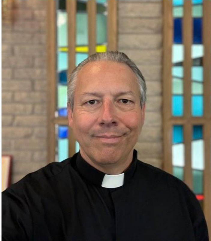
Missioner for Racial Reconciliation