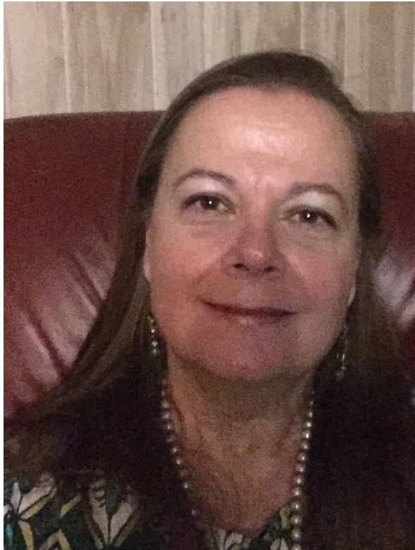
Rector of Good Shepherd, Lake Charles