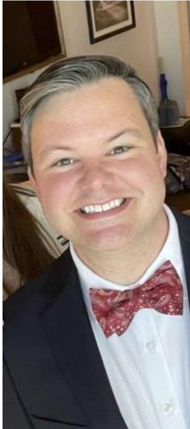
Member of St. James, Alexandria