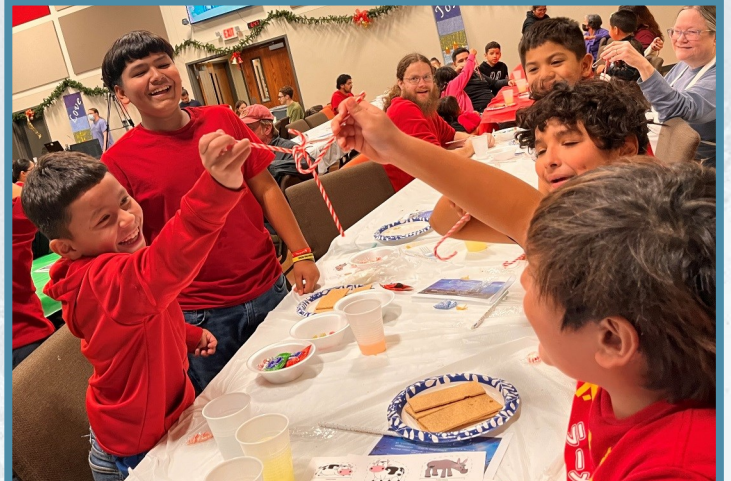
Gingerbread Bash had over 100 in attendance. We made nativities, played candy cane games, and heard the Good News of Jesus' birth.