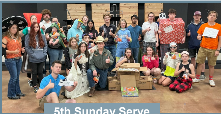
5th Sunday Serve