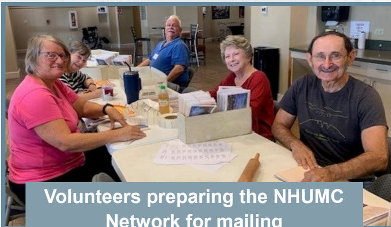
Volunteers preparing the NHUMC Network for mailing