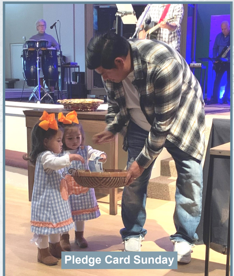
Pledge Card Sunday