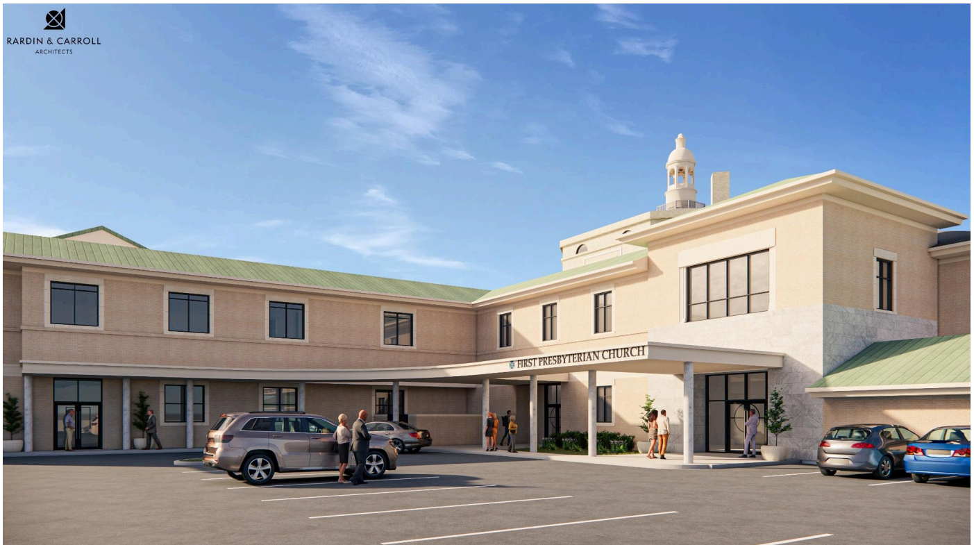
From Rear Parking Lot

The total estimated cost for the full initiative is $34,500,000.