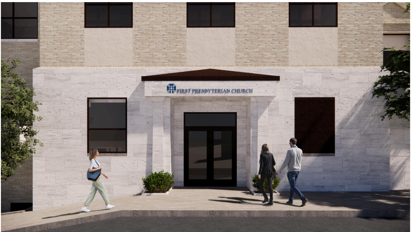
Douglas Street Entrance

The existing Douglas Street entrance will be enhanced by expanding the width of the entry, incorporating a new protective roof element to aid with the drop-off of children in inclement weather.