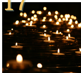
Service of Hope and Healing