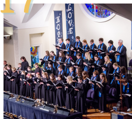
Festival of Nine Lessons and Carols