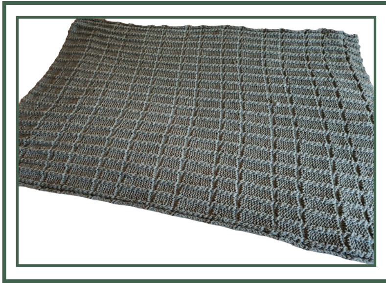
Green cable hand-knit Afghan Approximately 60" long by 40" wide

Estimated Value: Priceless Minimum Bid: $250 Donor: Lynn Nolan