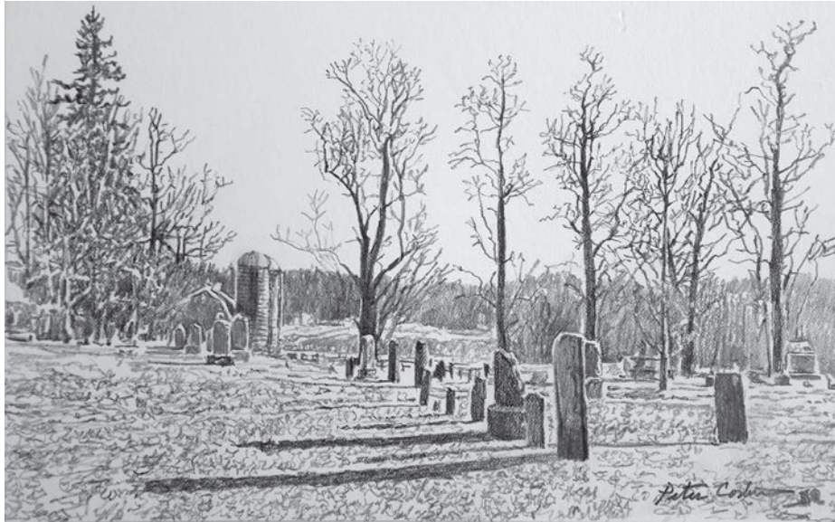
Drawing of St. Peter's Cemetery by Peter Corbin

The Loveliest Place to be Forever into Eternity