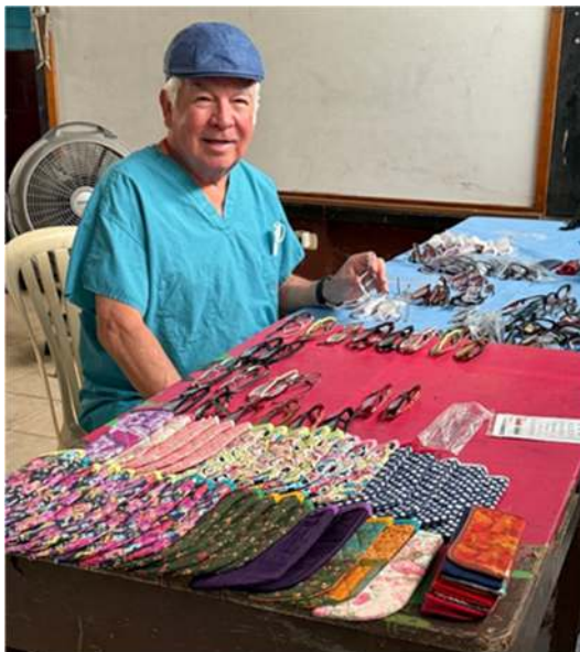
Reading glasses for many