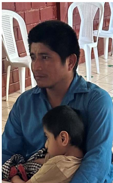
Father holding disabled son with cerebral palsy

The clinics sweltered today. It was 95° and the fans did nothing but blow hot air on us. Many of our patients have been up since 4 a.m. and take all day to get through the clinic. I am grateful for the opportunity to serve.