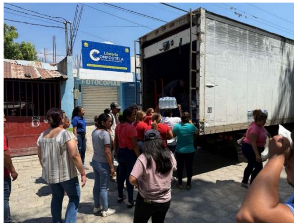
Unloading the equipment