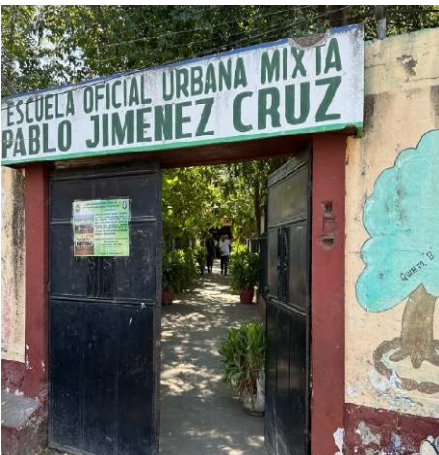
School where clinics were held

Our two buses filled with 45 American and Guatemalan volunteers left Antigua at the crack of dawn for the Department of "El Progreso," three hours to the north, where we will serve the village of San Agustin Acaseguastlan. A large truck crammed with medical supplies, wheelchairs, meds and our armed transport accompany us to the school in which we will be holding our clinics. When we arrived, an equal number of local volunteers, who will help us organize and assist our patients, was there to greet us. It was many hands on-deck in the 95° heat that enabled us to quickly set up the clinics for pediatrics, adults, gynecology, orthopedics, pharmacy, laboratory, and mobility that begin tomorrow morning. Local liaisons help to identify those in greatest need, and we expect to see 1000 patients this week!