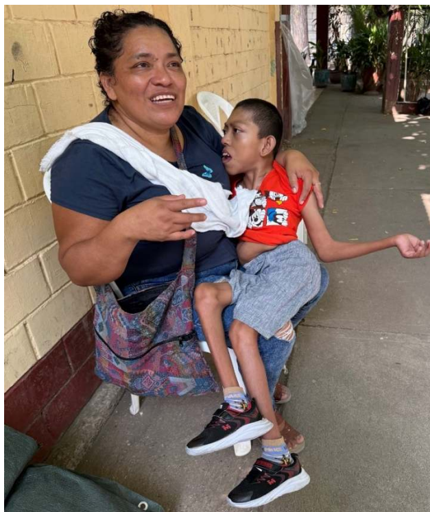
Mother and child with cerebral palsy awaiting a wheelchair