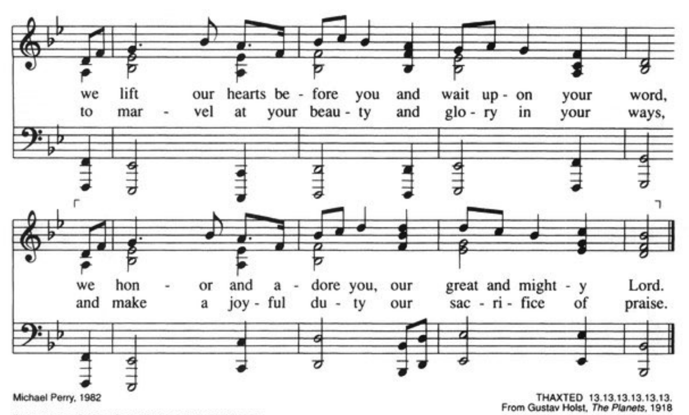
Text © 1982, Hope Publishing Co. All rights reserved. Used by permission.