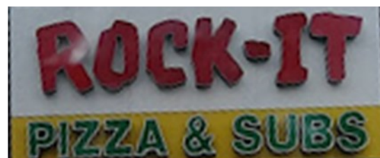
Self-Pay Food Truck