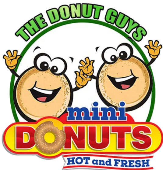
Self-Pay Food Truck