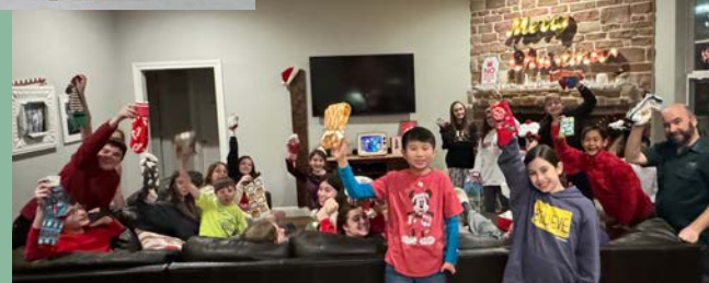
Youth Christmas Progressive Dinner + Sock White Elephant