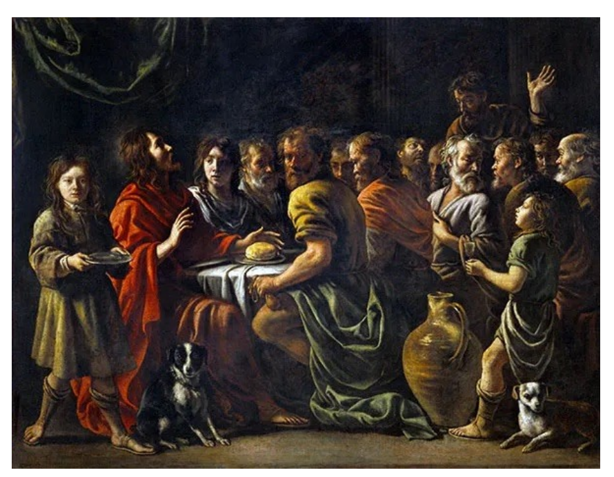
"The Last Supper"

Easter Sunday launches the worldwide Christian family into the liturgical season of Eastertide. The momentous importance of Jesus' resurrection cannot be contained within a single Sunday! In this 50 day period of Eastertide which leads up to Pentecost, we engage in an extended period of celebration as we explore the ramifications of Easter for the redemption of all creation and for joyful Christian living. In contrast to the solemn purples of Lent, in commemoration of Easter the cloth on our worship table is white, which symbolizes the brightness of the new day–and new world–that dawns in the resurrection of Jesus Christ.