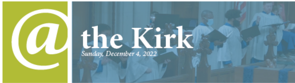
The Chancel Choir singing at the 11:00 a.m. Worship Service on 11.27.2022

@ The Kirk is a color insert which is distributed with our Sunday service bulletins. It is especially useful for short notices and announcements with contact information. However, space is limited, so preference must be given to items of the most general interest and close to the event they are publicizing.