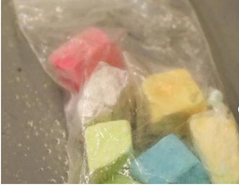
Brightly-Colored Fentanyl Used to Target Young Americans.