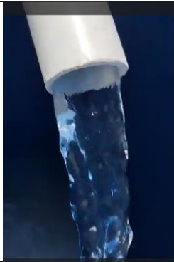
Water from Well