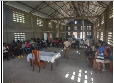
Port au Prince