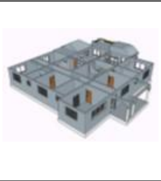
Manse 3D Model