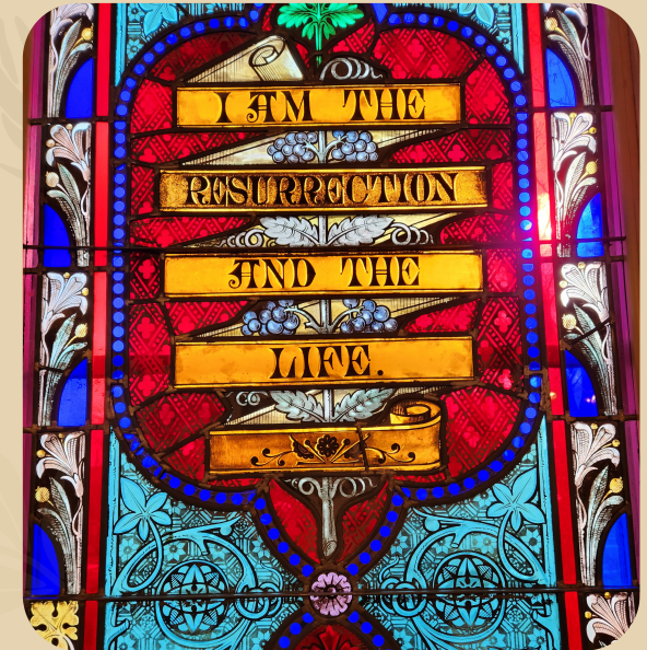
Stained Glass Window, Mechanicsburg First Church of God