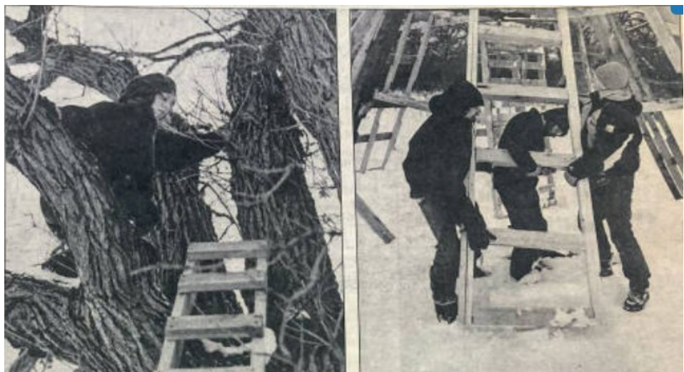
Photos from the Village publication, January 20, 1999. At left, a woman climbed an oak tree laying in the path of the planned reroute and strung yarn to jam any chainsaw used in felling the tree. At right, three men construct a shelter for protestors.

Campaign against planned reroute continues in the courts and at site