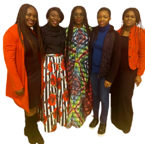
Sapphire Group (February facilitators)

Another powerful example was the fig tree that appeared full of life but bore no fruits - teaching us that outward appearances do not always reflect true substance, and that tough love sometimes involves calling out what is unproductive.