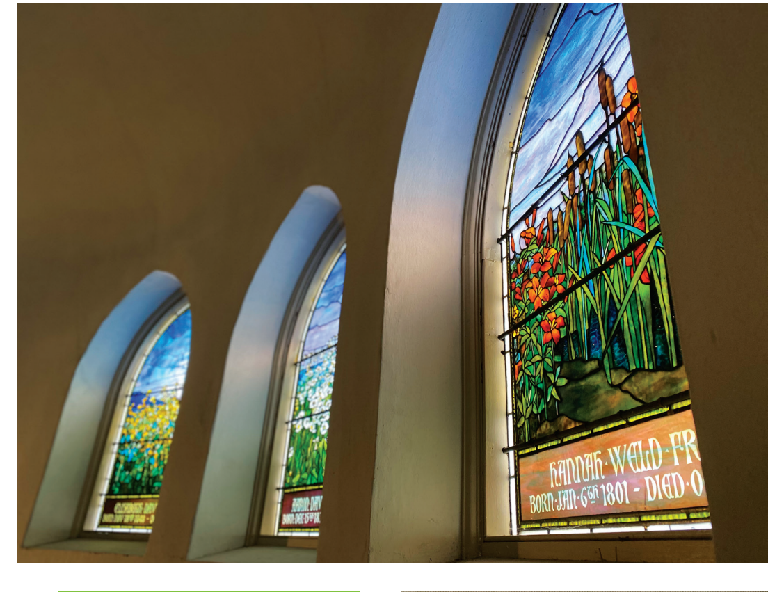
Our Ministry of Hospitality