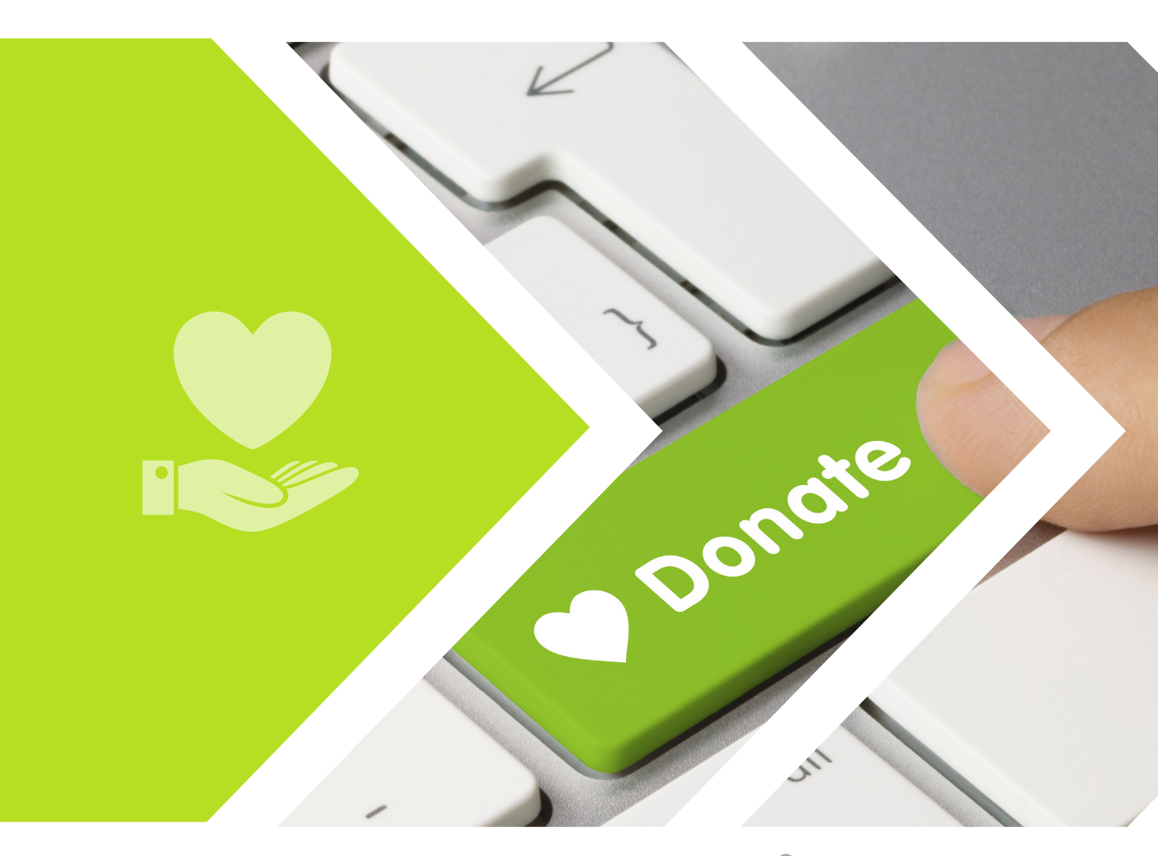
Part of a Series of 6 Small Group Studies