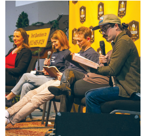
Theology by the Pint

Theology by the Pint invites believers and the spiritually curious to explore big questions of life and faith. They host monthly events that gather people from all worldviews together to talk about the interesting and often controversial topics around Christian Theology, Philosophy, Faith, and Culture. By offering a diversity of perspectives, they can showcase Christian charity in disagreement over non-essential views and a united voice telling people who might be otherwise disillusioned by the church, the hope and peace that comes from knowing and following Christ.