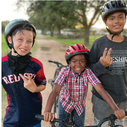
Boys and Girls Country

Boys and Girls Country provides a Christian home for children from families in crisis and ensures their care, welfare, safety and security. In doing so, they work with each child toward building healthy relationships, acquiring responsibilities, and setting realistic short- and long-term goals. Spiritual formation, family life, education, physical and mental health, and preparation for life beyond high school make up their core services.