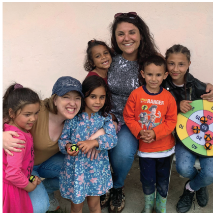
Youth With A Mission