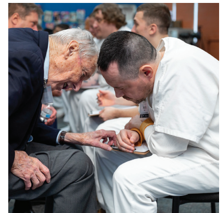
Prison Entrepreneurship Program