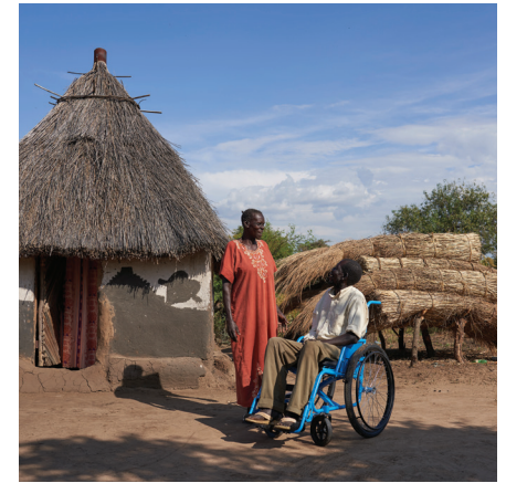
Free Wheelchair Mission

Houston International Seafarer chaplains minister to seafarers from around the world on ships that dock in the Ports of Houston, Barbours Cut, Galveston, Beaumont, Port Arthur, and Bayport. Chaplains minister to the seafarers at these centers and through ship visits.