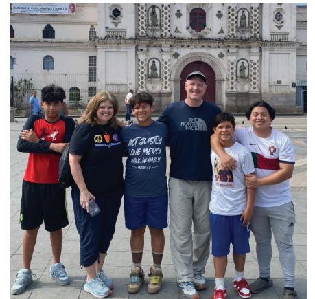
The Micah Project

The Micah Project ministers to young men and boys who have spent anguished childhoods in impoverished homes or on the streets of Tegucigalpa. The "Micah boys" are provided a loving home and learn to become Christian leaders through discipleship, education, and service to others. The Micah Project supports these young men as they learn to "act justly, love mercy, and walk humbly with our God." -Micah 6:8