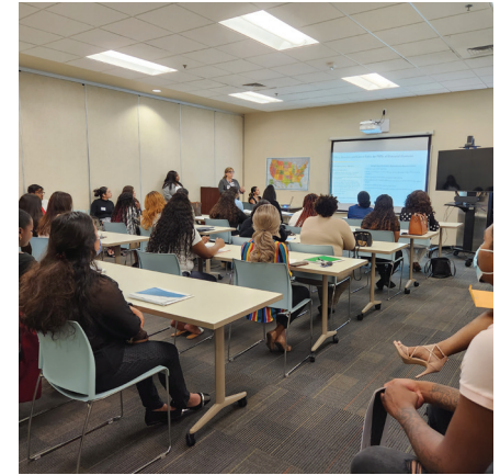
Memorial Assistance Ministries

Memorial Assistance Ministries (MAM) offers emergency help for rental assistance and other crisis situations, as well as educational programs such as ESL, employment services, citizenship, counseling and application assistance for public benefits. MAM Resale is a thrift store benefiting the mission of MAM and is open Monday-Saturday. MAM is integral to establishing healthy, supportive communities in north and west Houston.