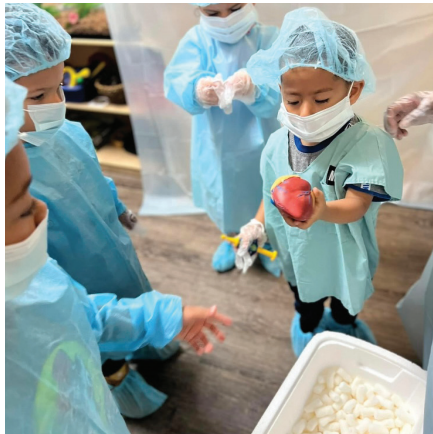
Nabor House Community

Nabor House Community invests in the growth and development of children from low-income families by providing quality, affordable early childhood centers in a Christian environment, enabling parents to pursue employment or education.