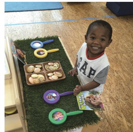
House of Tiny Treasures

This family lives in Saudi Arabia where they seek to introduce college age students to Jesus and build intentional relationships. Through teaching at a university and leading workshops and webinars, they have the opportunity to meet college students as well as their friends and families. Pray that the students they disciple will be a light in their country and will influence their society as they become leaders.