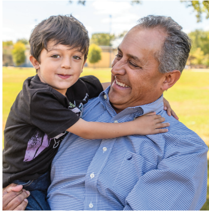
Houston Welcomes Refugees

Houston Welcomes Refugees (HWR) mobilizes our city to welcome refugees with compassion, hope, and honor as they resettle and start a new life in Houston. By providing move-in teams and welcome kits, HWR fosters hope amidst crisis and offers friendship for refugees coming to Houston.