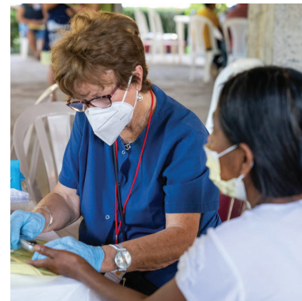
Faith in Practice

Faith In Practice works to improve the physical, spiritual, and economic conditions of people living in poverty in Guatemala through short-term surgical, medical, and dental mission trips and health-related education programs. The doctors, nurses, and dentists who volunteer on these missions are called by God to demonstrate the love and compassion that is an outward sign of God's presence among us.