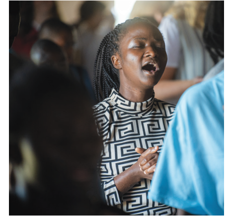
Lulwanda Children's Home

Grace International Children's Foundation addresses the urgent needs of children who have been abandoned or left orphaned by east Africa's AIDS epidemic by providing a loving home for them at Lulwanda Children's Home (LCH). MDPC teams have served at LCH where over 125 children receive holistic care including housing, meals, health care, and education all within a loving Christian environment. The on-site Lulwanda Primary School provides education to the children at LCH, as well as children in the community.