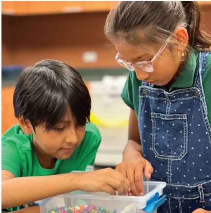
Cornerstone Family Ministries

Cornerstone Family Ministries is a faith-based organization, located in Spring Branch, that empowers at-risk students and their families to discover their God given purpose and calling. Programming encompasses ministry, education and social entrepreneurship.