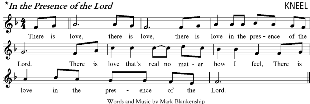
© 1975 McKinney Music, Inc. | Used by Permission. CCLI License #2282686 All Rights Reserved

Please share the peace with those near you.