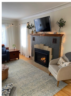
living room fireplace— AFTER