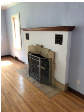
living room fireplace— BEFORE

Impact Partner / Shiloh Military Ministries (Stayed 6 months at Home Base)