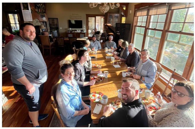
October Director's and Pastors Prayer Retreat at "Blessing House".

• Most of all that we would rely on God in all things.