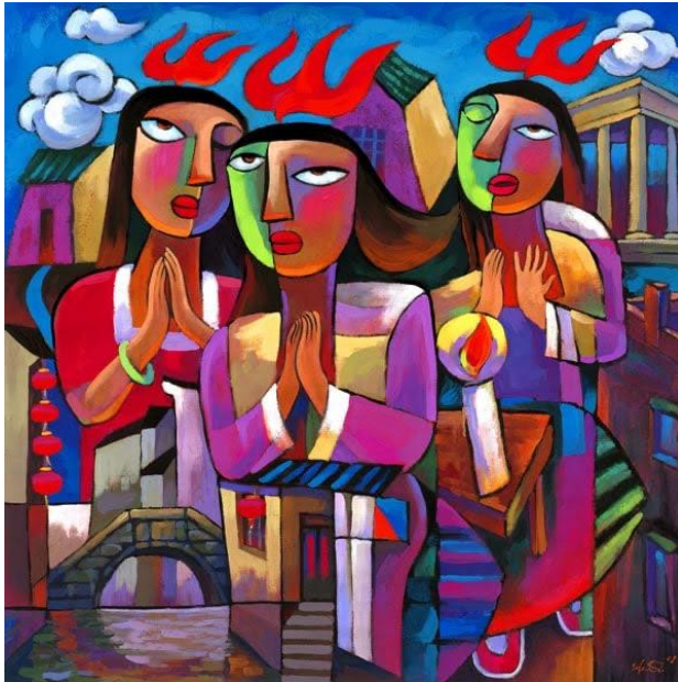
† Women Arriving at the Tomb | He Qi