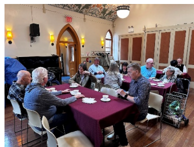
Tea at Three