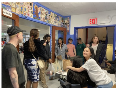
Art and Acceptance