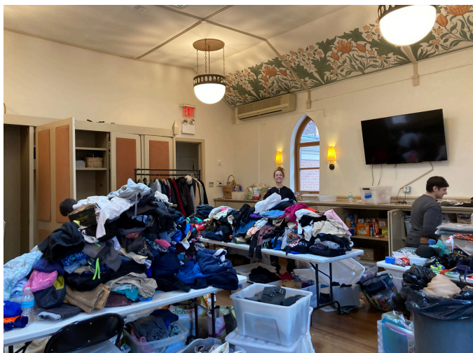
Volunteers organize our Community Closet