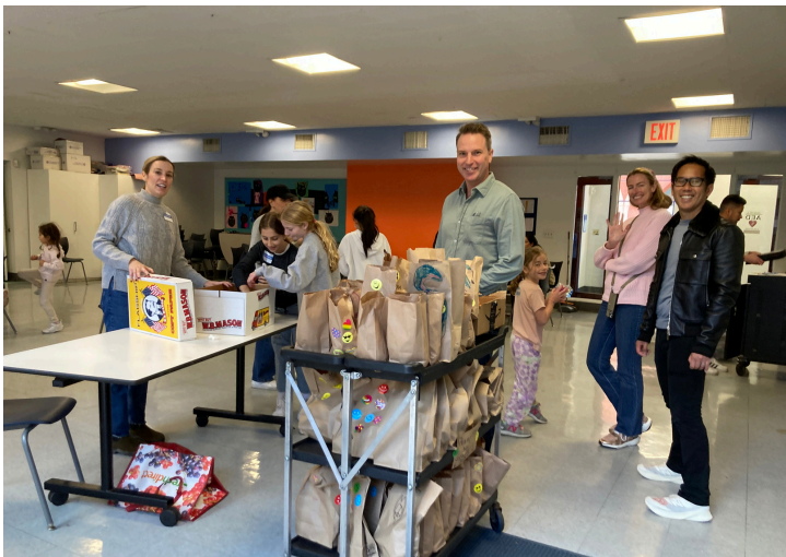
Families from St. Luke's School making lunches for our Community Closet