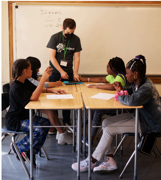
GO Project at St. Luke's