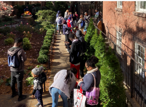
(Left) Guests are in line to visit our Community Closet which is open every Sat. 2-7pm in Laughlin Hall. From 2-4pm, it's open to the public, and from 4-7pm, our Art & Acceptance guests have access to it.

Every Saturday, our volunteers and community partners (e.g. New York Cares, St. Luke's School) schlep, organize and welcome marginally housed neighbors who visit our Community Closet, including recently arrived immigrants from all corners of the globe. We provide new socks and underwear, all manner of personal care and hygiene products, gently used clothing, sneakers and shoes. We also provide period products, baby gear, diapers and wipes, backpacks and rolling suitcases. We prioritize seasonal items like winter coats, hats, gloves and scarves. Sometimes we simply lend an ear. The picture at the bottom right was taken during our Community Closet Winter Coat Giveaway thanks to a generous donation of brand new coats from the New York Disaster Interfaith Services who delivered them to our doorstep!