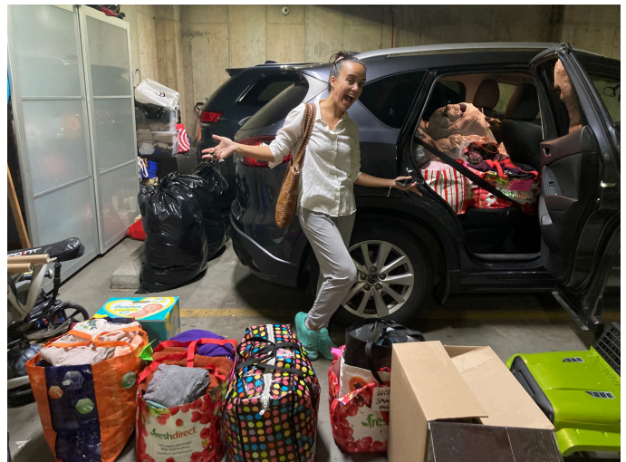
Gowanus Mutual Aid handing off wonderful clothing donations