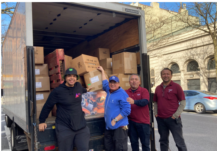
A truck-full of donated clothing and diapers delivered by Artists.Athletes.Activists