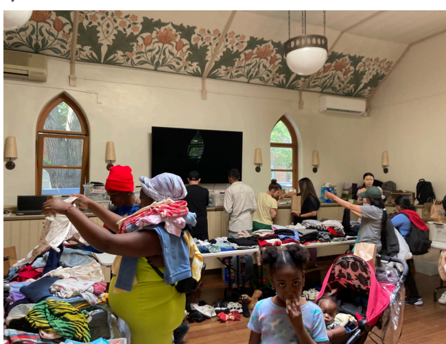
Community Closet guests stocking up on summer clothing