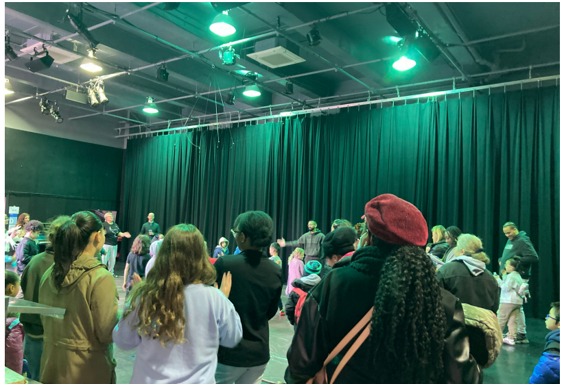
Morning Harambee (singing together) to start the day at GO Project at St. Luke's