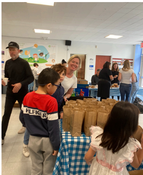
St. Luke's School families make lunches for Community Closet